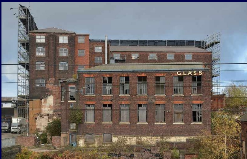
Fig 1: Chances Glass 7-Storey Building looking East