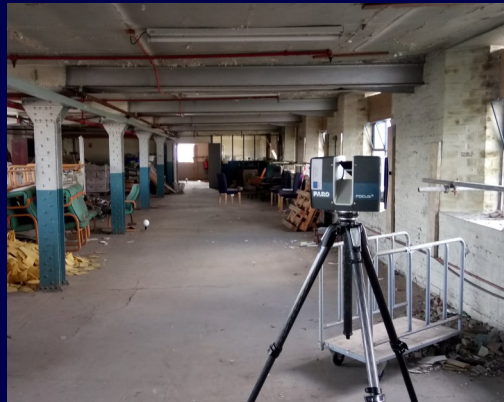
Fig 3: Inside 7-Storey Building laser scanning

capture raw scans, that were later registered to create a rendered single point cloud model.