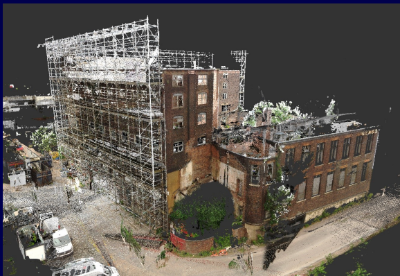
Fig 4: Point cloud colour data for 7-Storey Building looking North