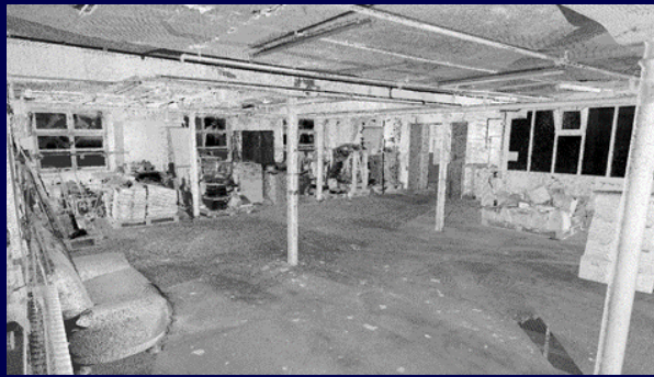
Fig 4: Point cloud mono data interior of 7-Storey Building

redevelopment process improving resource efficiency.