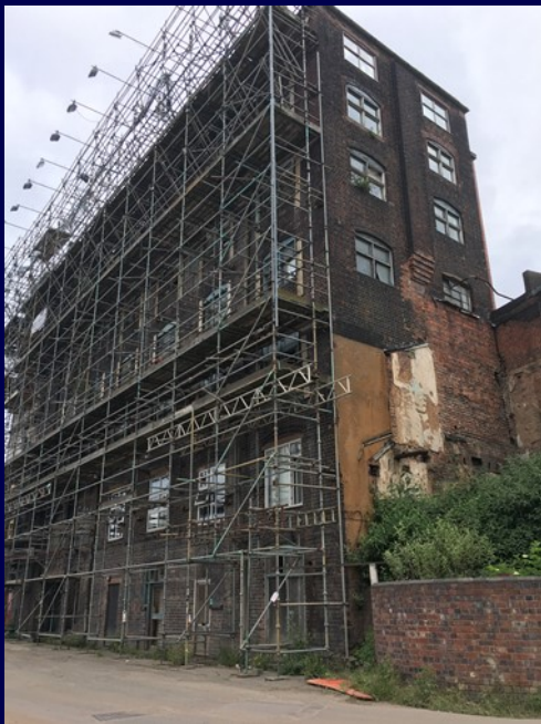
Fig 2: 7-Storey Building looking North

Through discussions with the company and a subsequent site visit, it was agreed EnTRESS would laser scan a portion of the 7-storey building aiding redevelopment plans and offering CGWHT opportunities to implement BIM (Building Information Modelling) processes into the future renovation project.